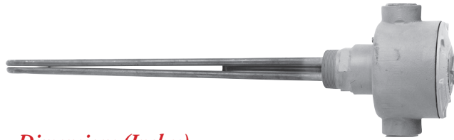
E2 — Dimensions (Inches)